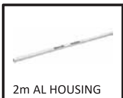
2m AL HOUSING