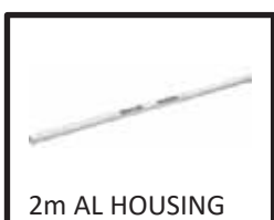
2m AL HOUSING